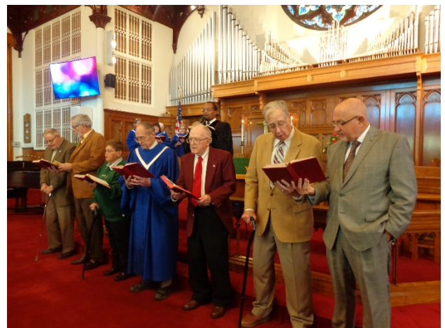
Kemble's veterans were honored on November 8