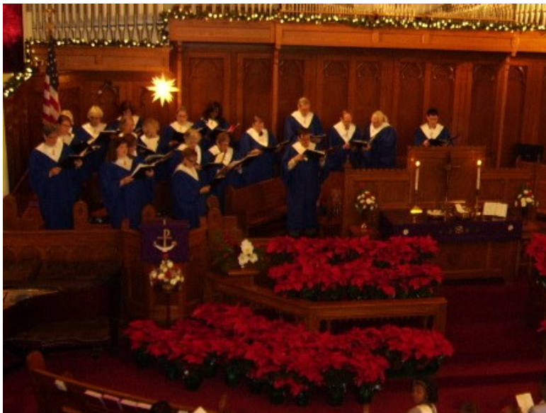
At left: Kemble Choirs presented an Advent Service of Lessons and Carols in the beautifully decorated sanctuary.